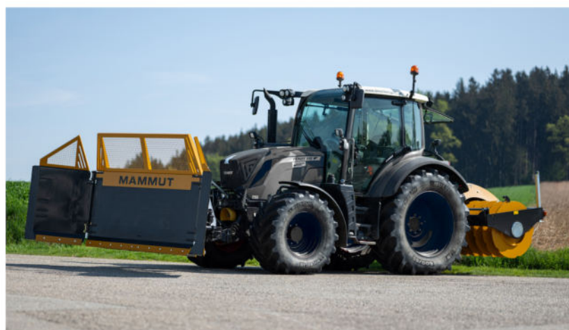
The ideal silage harvester for maize harvesting: Spreading and compacting in one work step

With the individually folding side sections the chopped material can be precisely to the desired location. Practical accessory options further increase working comfort. For example, the SILO PUSH can be perfectly adapted to the requirements.