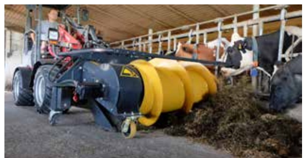
Fresh feed is attractive for cows: Loosening up during pushing increases the basic feed intake.

Studies have shown that more frequent pushing and aeration have a positive effect on the health and performance of the animals. It is possible to draw conclusions regarding the health of the animals from their feeding behaviour. Working with the FEED MASTER takes away the laborious manual work, although it remains possible to keep a constant eye on the herd.