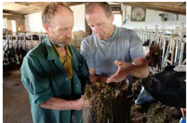
Constant mixing and aeration during feed pushing maintain the feed quality.

The spiral drum returns feed that has been pushed away to the feeding table again. Instead of simply pushing and compacting the feed, the MAMMUT feed refresher loosens and mixes up the ration continuously. This prevents unnecessary compaction and the associated secondary fermentation and quality losses. At the same time the feed remains clear of contaminants.