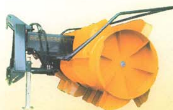
SF 230/280 Gigant