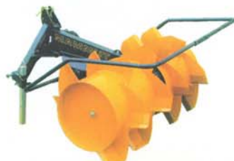
SF 175 HSB