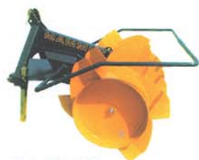
SF 175 ST